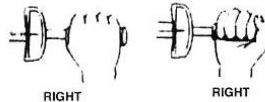
FIGURE 1.2.1.2 GRASP THE TORQUE WRENCH IN THE CENTER OF THE GRIP AREA (2.2.2.1)